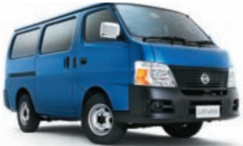
Astro Blue B21

Its dimensions are impressive: a load space length of 2720mm, a space width of 1545mm and a load space height of 1350mm combine to give an echoing space of 5.7 m 3 behind the driver. Access is a breeze through the wide side doors and large rear door. Added to that, it has a low floor height of 635mm making cumbersome objects that much easier to load. On top of that, ABS braking and a load-sensing valve make sure your load will be safely delivered.