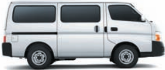
Sheer Silver K23