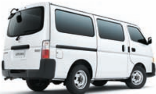
Aspen White QM1